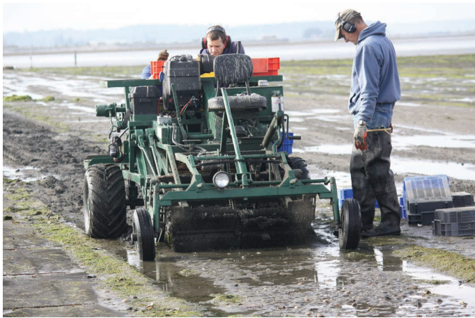
FIGURE 7. A tulip-bulb harvester modified to harvest Manila clams after predator netting has been removed.

Reusable polypropylene mesh (6 or 10 mm square openings) predator nets (90-460 m long × 1.2 m wide) are installed in strips, buried along the edges and fixed to the sediment with large steel staples (Fig. 4). Clam seed (3.2-3.5 mm shell length) is planted through the net mesh within strips at about 750 individuals per m 2 . During a growing cycle of 2-3 years, nets are swept approximately monthly from spring to fall (net fouling is minimal in winter) to remove fouling (Fig. 5). Fouling occurs mainly through attachment and growth of macroalgae ( Ulva sp. and Sargassum sp.) on predator nets. Before clams grow too large to fit through the mesh, biofouling can result in clams moving to the surface on top of the net but under the algae in an attempt to escape apparent suffocation, but this results in seed loss when nets are swept. Thus, it is critical to keep predator nets clean until clams are too large to move through the mesh. When clams are too large to pass through the predator net, sweeping is necessary to remove macroalgae to avoid suffocation of clams and improve water flow (Fig. 6). Additional farm maintenance involves inspecting and re-burying edges of the predator net. The principal predators excluded are Dungeness crab ( Metacarcinus magister (formerly Cancer magister ), the red rock crab ( Cancer productus ), and the graceful crab ( Cancer gracilis ). Surf scoters ( Melanitta perspicillata ) and white-winged scoters ( M. fusca ) are also seasonally important