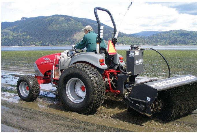
FIGURE 6. A modified tractor-powered “street sweeper” to remove macroalgae biofouling from predator nets.