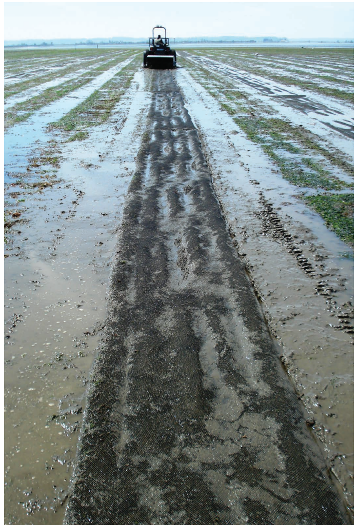
FIGURE 5. Regular net maintenance is a critical part of clam farm operations. During late spring to early fall, a variety of macroalgae settle and grow on the surface of the net. Much of this algae consists of the green sea lettuce ( Ulva ), along with the brown algae Fucus and Sargassum .

aspects of farm production and harvest operations.