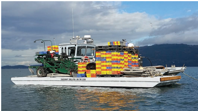
FIGURE 3. A work barge towed by the landing craft and used to carry the mechanical harvest machine, clam bins, netting and other supplies.