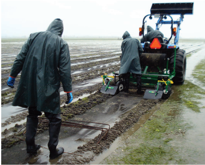
FIGURE 4. Installation of predator netting. Clam netting is spooled out from the tractor in long generally north to south rows. Tension is maintained on the net to ensure it lies close to the ground and the edges are driven into the sediment and sealed with planting tools mounted on the tractor. Large metal staples are pushed into the bottom along the length of the netted rows at approximately 50-ft intervals. Once sufficient netting is installed, seed clams are dropped onto the net surface during an incoming tide. These clams drop through the netting and remain in place, covered by the predator net until harvest.