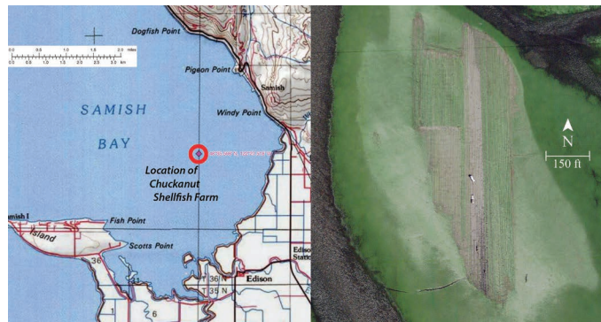
FIGURE 1. Samish Bay, North Puget Sound, with the location circled of the Chuckanut Shellfish farm location (left). Layout of the farm showing the locations and lengths of individual planted rows (right).

About 15 years ago, Chuckanut Shellfish in Samish Bay (Washington State, USA), which is an embayment of Puget Sound, in the Salish Sea (Figs. 1 and 2), began experiments to adapt land-based agricultural practices to Manila clam production, applying results from several years of small-scale trial clam plantings and a long history of successful oyster production in adjacent areas of