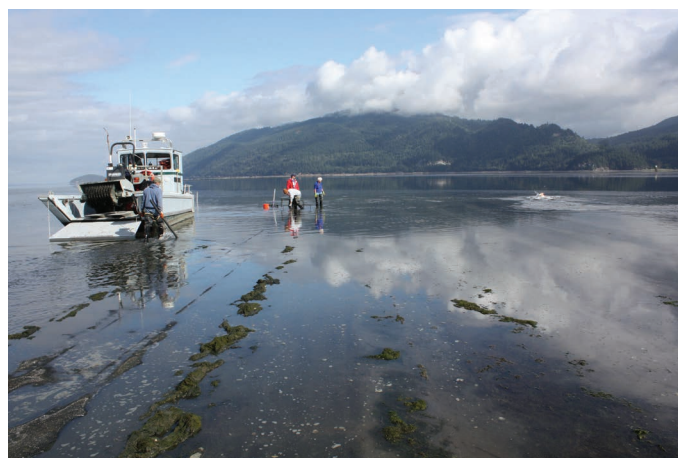
FIGURE 2. The Chuckanut Shellfish farm is located in the middle of Samish Bay and several miles from the nearest land. A landing craft is used to access the growing beds and to carry a small tractor, bed maintenance equipment and people across the bay. The day begins and ends with the fall and rise of the tide and at high tide water six feet deep or greater covers the farm.

Samish Bay. The production method combined predator netting, mechanical net deployment and sweeping, and a modified tulip-bulb harvester to intensively cultivate and harvest Manila clams. This has allowed effective predator protection, biofouling control, and efficient harvest. With a per-person harvest rate of 1,100 to 1,300 kg/h, total harvest costs are now reduced to 3 to 5 percent of the farm gate value.