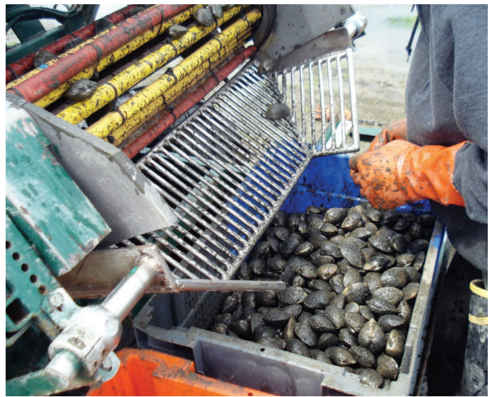
FIGURE 8 (TOP) AND 9 (BOTTOM). Close-up of the mechanical harvester and clams. A combination of a vibrating rake and rotating brush dig clams buried 2-4 inches deep onto a conveyor. The vibratory action also shakes most of the sand off the clams, so by the time they reach the bins, they are fairly clean. Each bin holds about 50 pounds of clams.

predators (Lewis et al. 2007). In the Pacific Northwest, Manila clams are rarely found in significant densities in sand, presumably because they are easily detected and consumed by predators. This was painfully evident to Chuckanut Shellfish as they pioneered farming Manila clams in sand. When nets are dislodged by storms, predation can be 100 percent in as soon as 24 hours.