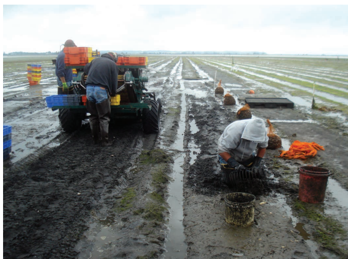
FIGURE 12 (TOP AND BOTTOM). Mechanical Manila clam harvester operating next to a traditional manual harvester in Samish Bay, Washington.

short-handled rakes. As of the date of this publication, Chuckanut Shellfish’s modified tulip bulb harvester has dug one million pounds of clams over the past 16 years. Although designed for use in a tulip greenhouse, with routine cleaning, maintenance and occasional parts replacement, it works very well as a clam harvester.